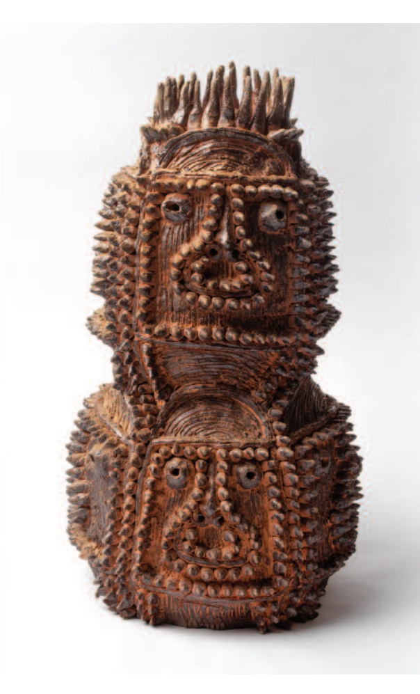
above: Untitled (53) , n.d., ceramic, 8 x 13 x 7 in. / 20 x 34 x 18 cm, photo: Ellie Walmsley opposite: Untitled (1) , n.d., ceramic, 7 x 14.5 x 6 in. / 18 x 37 x 16 cm, photo: Andrew Hood

the combination of fidelity – realism, if you will – and freedom of imagination. They displayed a faith in the power of imagination, depicted with absolute precision, that I had rarely encountered before."