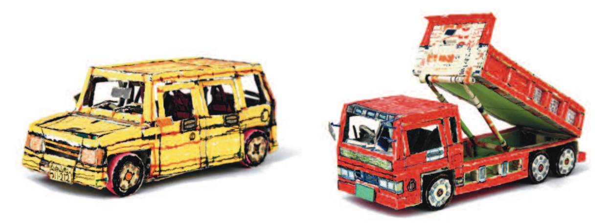
top: Two paper cars, 2017, paper, 1.5 x 2 x 5 in. / 4 x 6 x 12 cm (left), 2 x 2 x 6 in. / 6 x 6 x 16 cm (right), photos: Satoshi Takaishi