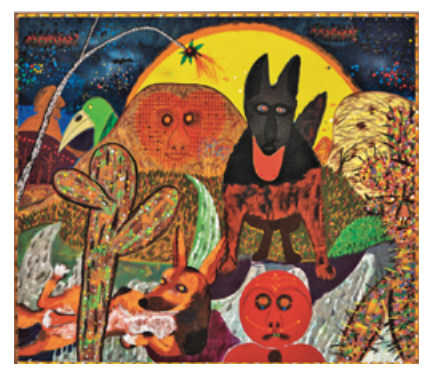
Baja Nights, 1982