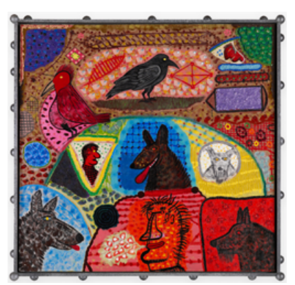
Birdsong of the Working Dog, 2006