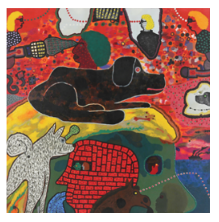
A Figure of Our Time, 1972