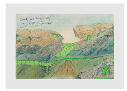
Trinity and Brazus Valley near Elpaso Texas, 1964

For all press inquiries related to the exhibition, please email <a href="mailto:press@venusovermanhattan.com">press@venusovermanhattan.com</a>