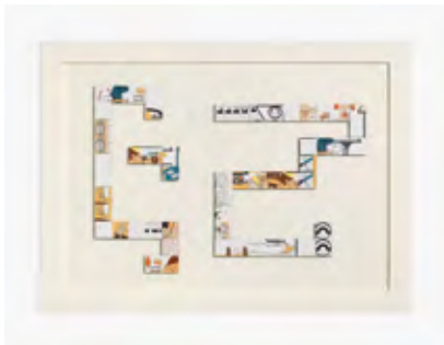
Öyvind Fahlström, Sitting...Dominoes , 1966