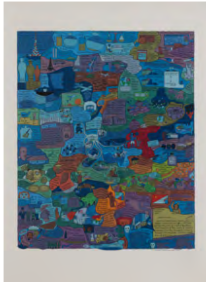
Öyvind Fahlström, Column no. 2 (Picasso 90) , 1973