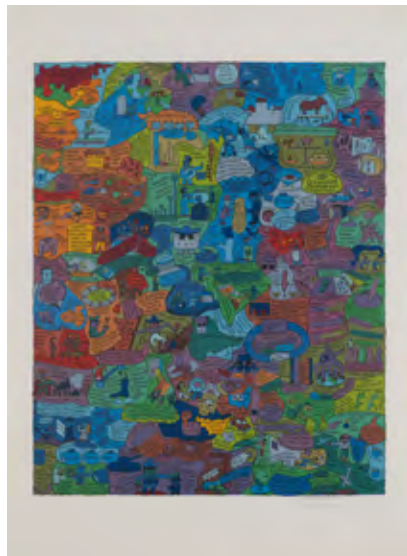
Öyvind Fahlström, Column no. 4 (IB-affair) , 1974