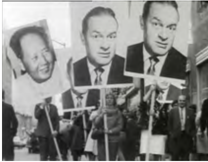
Öyvind Fahlström, Mao-Hope March , 1966