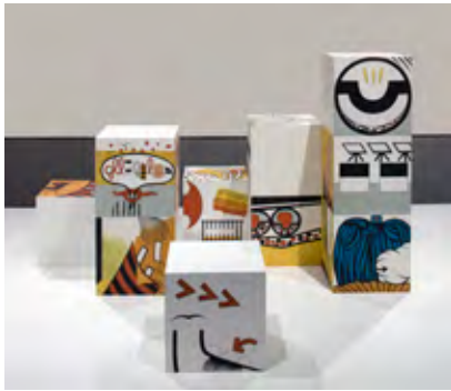
Öyvind Fahlström, Sitting...Blocks , 1965-1966