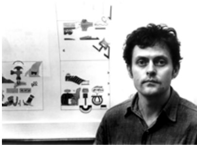
Portrait of Öyvind Fahlström