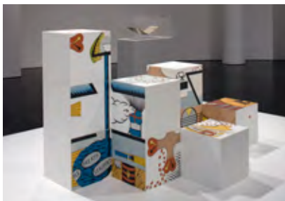
Öyvind Fahlström, Sitting...Blocks , 1965-1966