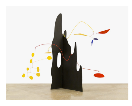
Alexander Calder, Crag with Petals and Yellow Cascade, 1974, standing mobile – sheet metal, wire, paint © 2019 Calder Foundation, New York / Artists Rights Society (ARS), New York.