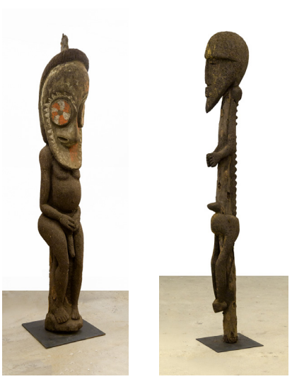
Grade Society Figure, Ambrym Island (L) Banks Islands Suque Grade Society Figure (R)

(New York, NY) – Opening on April 25<sup>th</sup>, Venus Over Manhattan will present Calder Crags and Vanuatu Totems from the Collection of Wayne Heathcote , an exhibition comprising a suite of large-scale standing mobiles by Alexander Calder, and a group of historical Vanuatu figures from the Ambrym, Banks, and Malekula islands. On view through June 8<sup>th</sup>, the presentation will provide an unprecedented context in which to consider the powerful achievements of these uniquely transcendent sculptural forms.